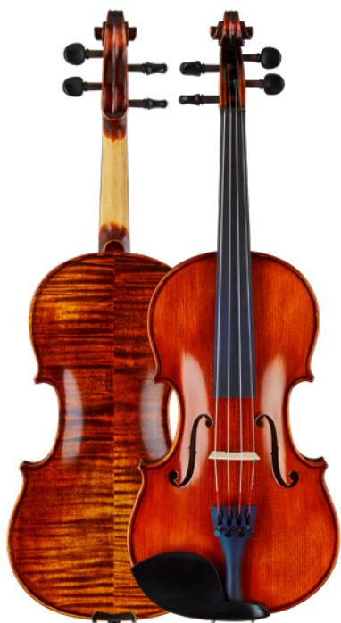
114VN AND 114VA