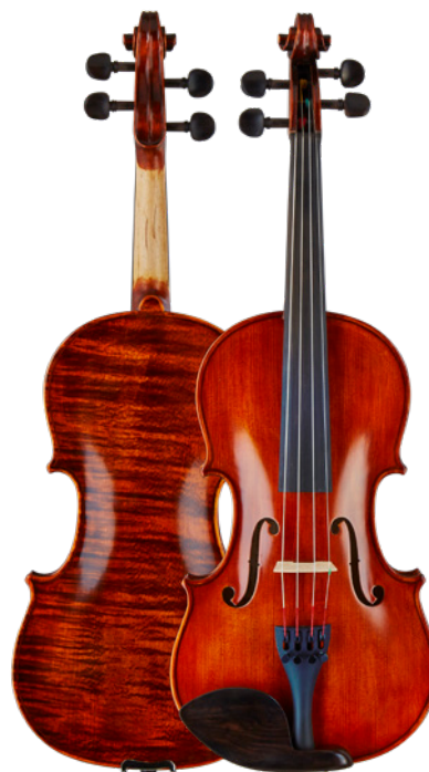
116VN AND 116VA

Available in 4/4 size in violin and 16-1/2", 16", 15-1/2", and 15" sizes in viola.